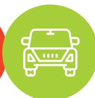
GOING FOR A DRIVE