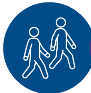
GOING FOR A WALK

Activities create conversation. Find an opportunity during everyday life activities to start the conversation and ask them how they are really feeling. Try doing activities together such as: