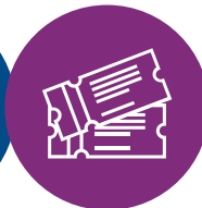
GOING TO AN EVENT TOGETHER