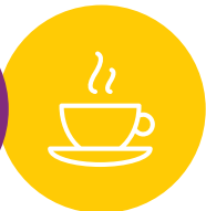
GOING FOR A COFFEE OR A MEAL