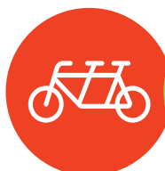
KICKING THE FOOTY, PLAYING A GAME, SURFING ETC